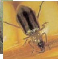
Western corn rootworm