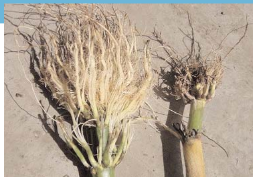
With Proprietary Trait Without Proprietary Trait

Pioneer has received full regulatory approval for both Herculex RW and Herculex XTRA in the U.S. and Canada. These products are now all available commercially in both countries. We are also aggressively seeking import approval from Japan and other key countries.