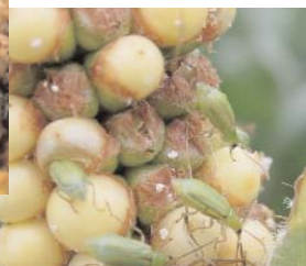
Ear damage from northern corn rootworm